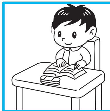
Studying in school